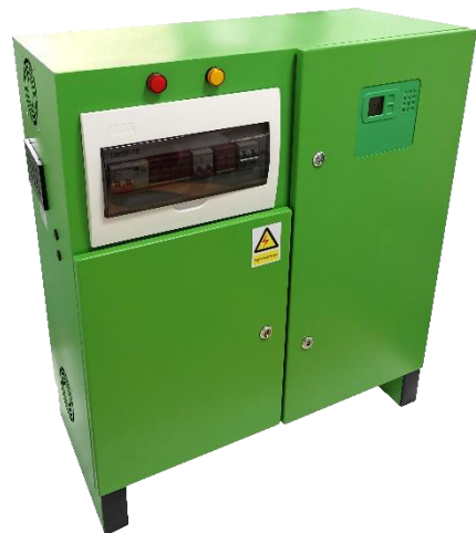
System box appearance can modify

The LiFePO4 Battery for the Compact AC Solar Home System is using one of the longest lifetime Lithium technologies and therefore ideal for solar applications. Its excellent behavior at low SOC conditions can give best performance at low sun conditions and allow making use of the full capacity. Additional the wide operating temperature range makes it ideal for most areas in the world. The Integrated MPPT Charge controller and AC inverter with its unique single cell monitoring for optimizing the battery operation can ensure the best System performance. The ready to use system makes the product useful for many applications, which can significant reduce the service, maintenance and installation cost.